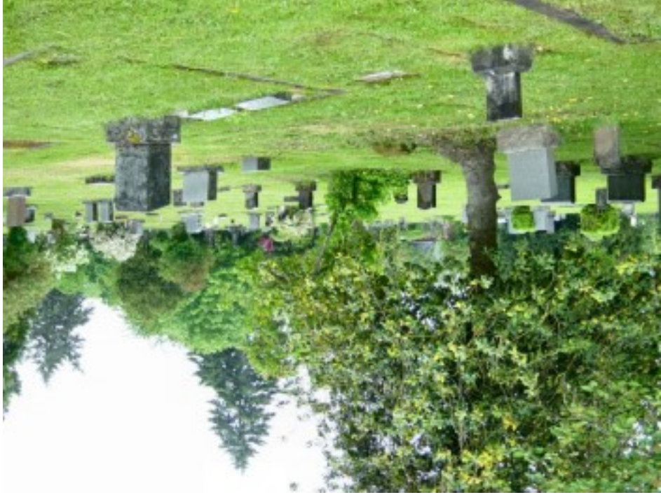
Lee Mission Cemetery PO Box 2011 Salem, OR 97308